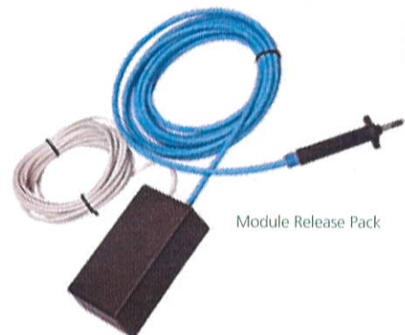
Module Release Pack