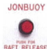
Module Switch Pack